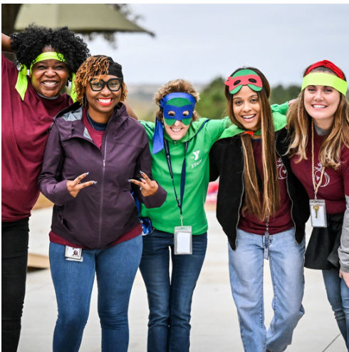
International Women's Day at CabCo