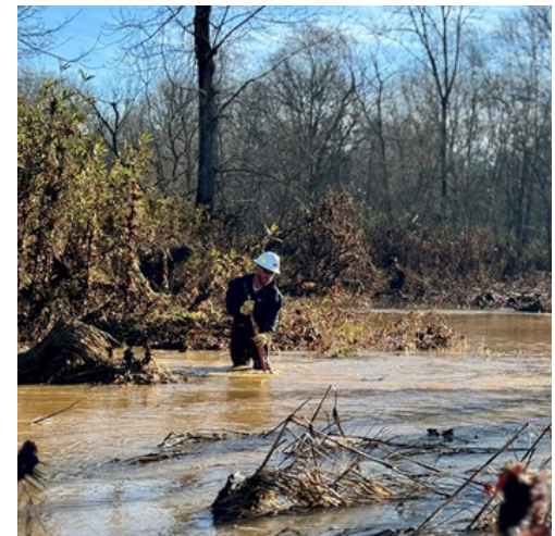
Spring is here, flood season is near